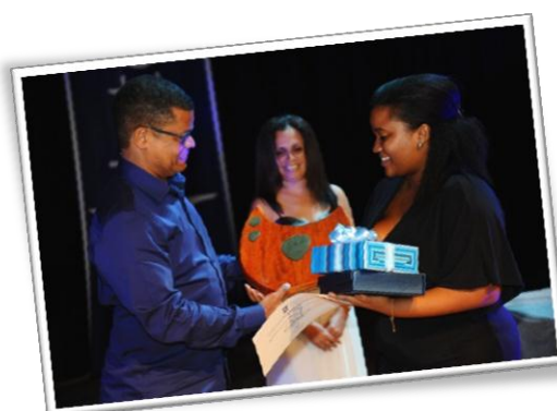
ISS Achievement Evening 2014